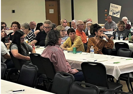
FCC Guthrie "Live Like You're Dying Seminar." Free estate planning seminar with expert panelists.