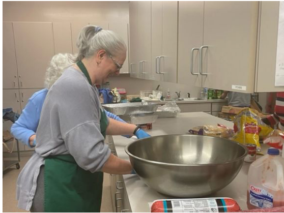
FCC Midwest City Mobile Meals preparation. Since 1973, the church has provided hot weekly meals to those unable to care for themselves.