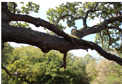
Native tree left while clearing a trail.