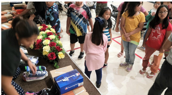
Central Christian Church, Enid's Foster Feet program provides new shoes to refugee children in a Tulsa area Disciples tutoring program.