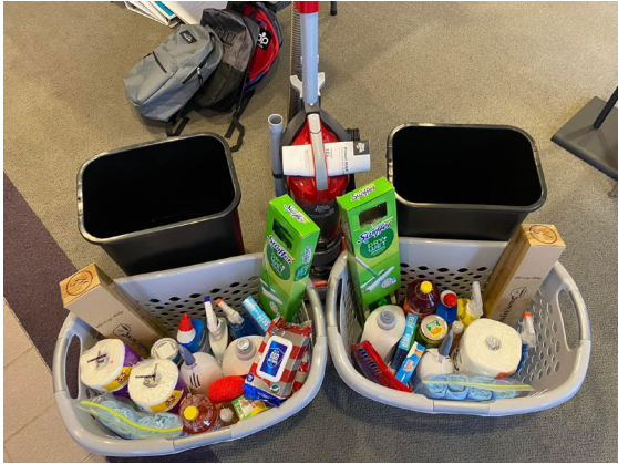
FCC Midwest City Welcome Home Baskets for families moving from shelters to their own places. Homeless liaisons can't use federal funds for this purpose.