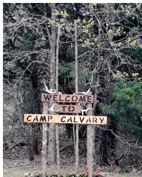
Camp Calvary sign.