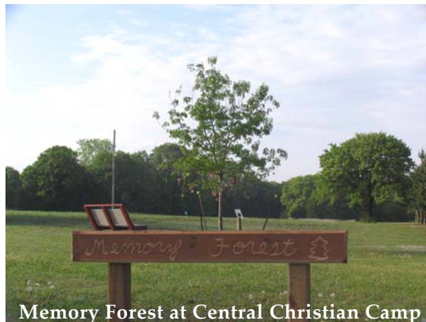
Memory Forest at Central Christian Camp